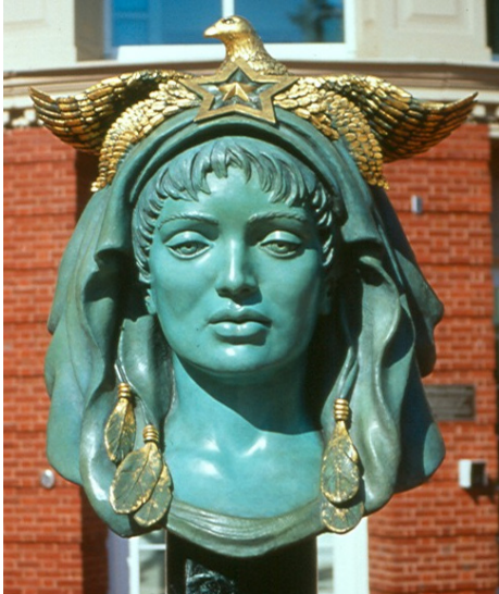
The Beloved Woman of Justice, Knoxville, TN by Audrey Flack