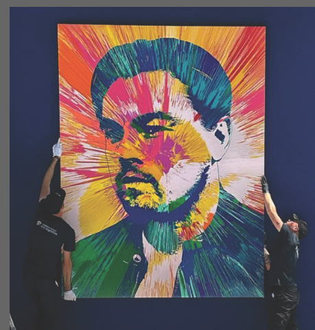
Damien Hirst Beautiful Leonardo DiCaprio Looking Away Painting , 2016