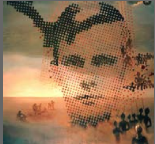
SALVADOR DALI - PORTRAIT OF MY DEAD BROTHER (1963) THE REDDIT MUSEUM

When Dali was 5, his parents took him to his older brother's grave and shared their belief in reincarnation with him, something he came to believe. His brother, also named Salvador, had died just 9 months before the artist's birth.