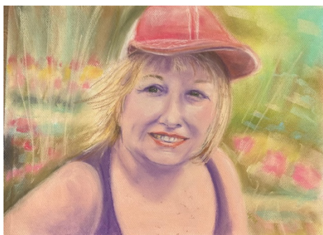
"A Beautiful Day to Smile", self-portrait, pastel

I have always taught workshops at the state and national level conferences as many of you have. Since retiring, I have continued to teach art either as an adjunct faculty to higher ed, conferences, art councils, art events at my home or with my grandchildren and grandchildren of friends. The last 4 years one of my greatest joys has been to plein air pastel or pastel from photos taken on the vacations my husband and I are now taking, whether in the US or out of our country. Many of you are doing the same!