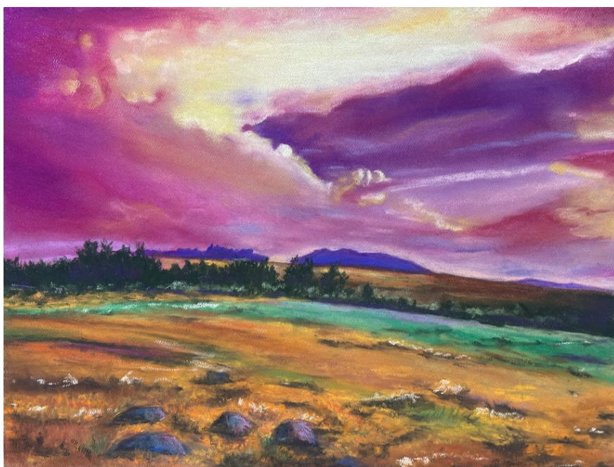
"Wichita Mountains in Oklahoma", pastel donation for the Purple Sash fundraiser for the YWCA, in OK City, domestic violence and sexual assault