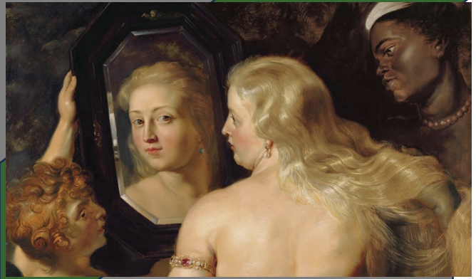
Detail - Venus at a Mirror, c1615, Peter Paul Ruebens