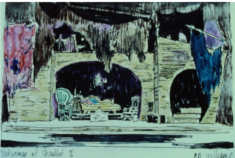
Set design "The Madwoman of Chaillot"

I am in awe of the learning I've experienced from every encounter with diverse glimpses of humanity – all through the lens and power of the arts.