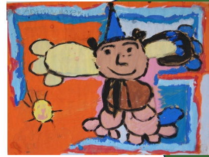
1 st Grade Clown Painting

A transfer to Orlando led to starting an art program in an inner-city school, with a yearly budget of 18 cents per student. I enjoyed the challenge of finding inventive solutions. "Found materials" projects made the cover of Arts & Activities . We used squirt bottles for water, phone books for paper towels, printmaking, ironing batiks, and more. I still treasure the lessons I learned.