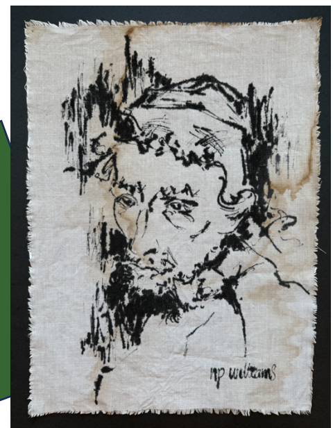
"Masque" - ink dropper on burlap