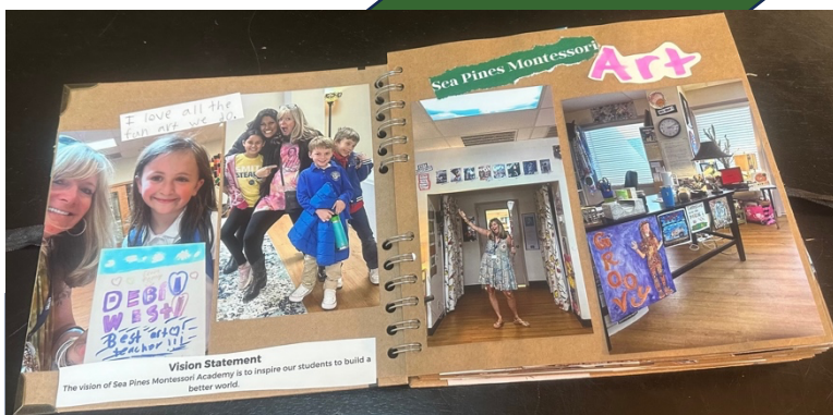
Scrapbook pages by Debi West