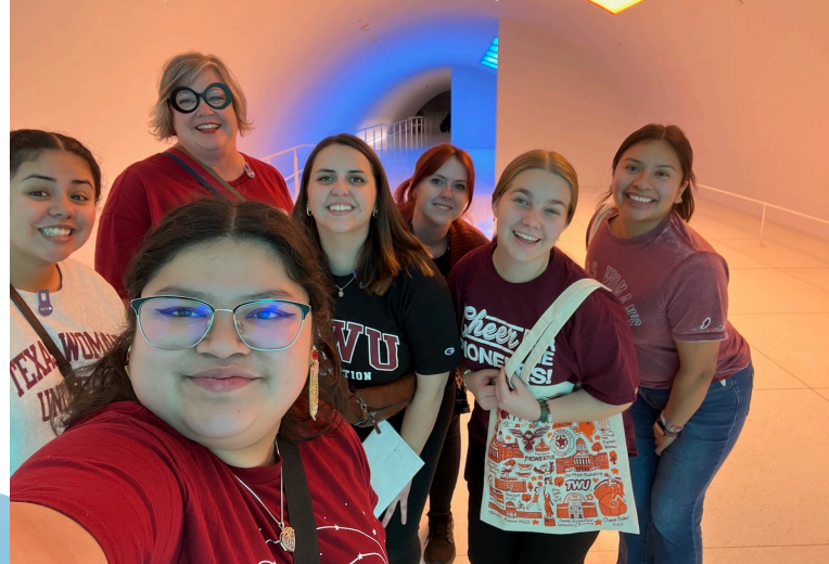
Student Chapter: Texas Woman's University

NAEA's membership includes individuals from multiple facets of the art education field, including museum educators, higher education professionals, community arts organization leaders, teaching artists, studio instructors, and more! Additionally, members can join an NAEA Interest Group.