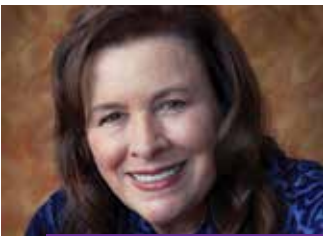
JEAN HOUSTON Philosopher, Researcher in Human Capacities

LEARN FROM AND COLLABORATE WITH THESE CREATIVE MINDS: